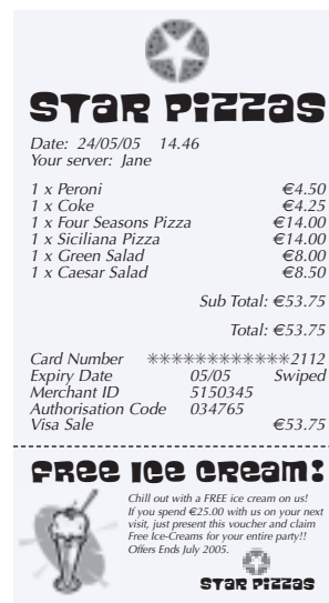
Typical example of receipt with TrueType fonts and Graphics