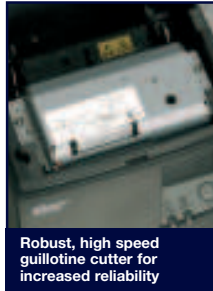
Robust, high speed guillotine cutter for increased reliability