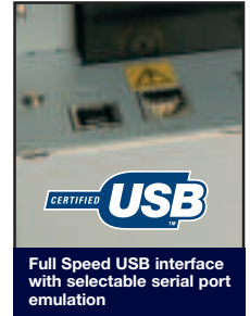
Full Speed USB interface with selectable serial port emulation