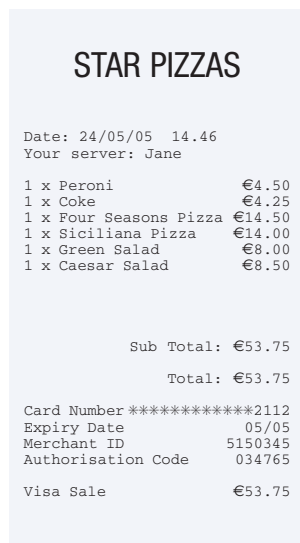
Typical example of receipt with Resident Fonts