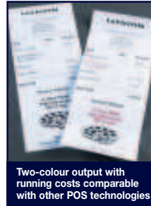
Two-colour output with running costs comparable with other POS technologies